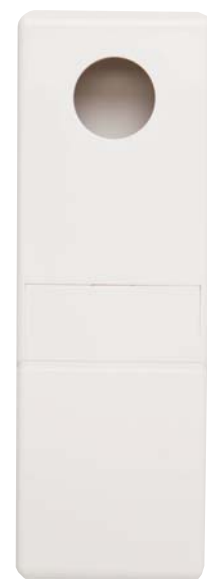
HBA Wasp Adaptor FHBADAPTOR