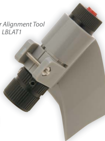
LB Laser Alignment Tool LBLAT1

The laser alignment tool provides a visual indicator of the LightBAT G2's lens direction.