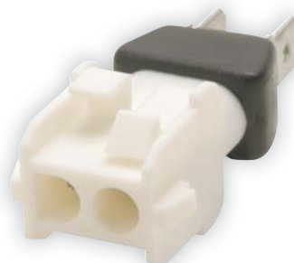
MYzerPORT Connector MPC2P10

Extension adaptor used for positioning the HBA Wasp sensor flush or below the bottom of the fixture's reflector for full field of view coverage.