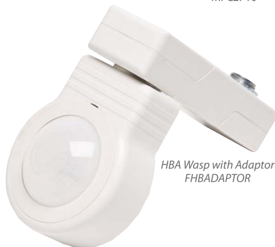
HBA Wasp with Adaptor FHBADAPTOR

Aisle and End-of-Aisle lens masks used with the HBA Wasp sensor. Available in packs of 10 pairs.